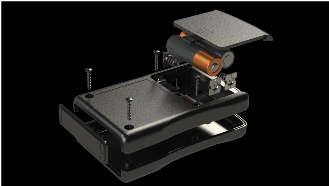
Fig 3.2.2: Prototype CNC Housing

Below is a prototype model of the CNC housing we can use in our final product.